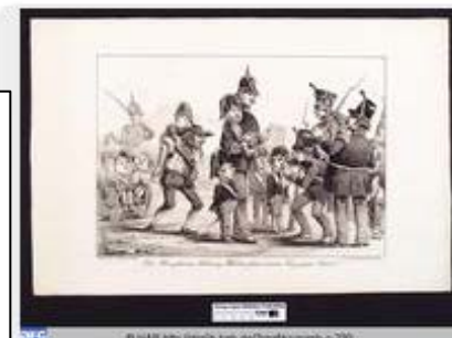
Die Herzogthümer Schleswig-