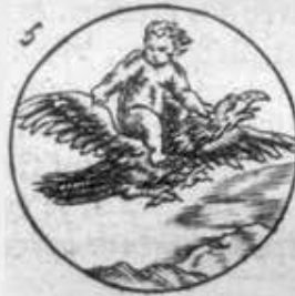
Ganymedes flying on the eagle of