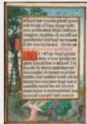
Hermit, accompanied by his guardian