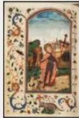
St. Michael weighing souls, conquering the